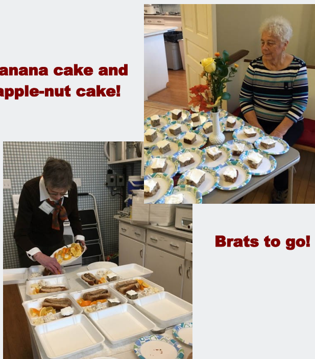
Brats to go!