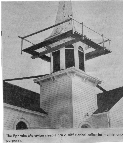
The Ephraim Moravian steeple has a stiff clerical collar for maintenance purposes.