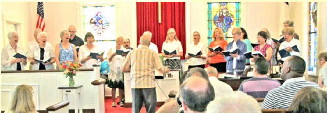
Worship with Divine Word on August 18

We are sorry if we omitted or listed incorrectly someone's name from the list. Please call the church office (854-2804) or email us at ( worship@ephraimmoravian.org )