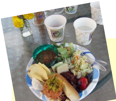
Picnic with Divine Word Pentecost & Lutheran Church August 17, 2013