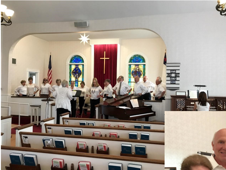
From the "Psalm of Joy" concert on June 25

PASTOR: TUES - FRI 9 a.m. - 12 p.m. MONDAY Pastor's Day Off SECRETARY: WED. - THURS. 9:30 a.m.—4:30 p.m. CELL NUMBER: 920-421-4042 The Church Phone does NOT ring in the parsonage. Please keep the Pastor's Cell Phone handy for after hours.