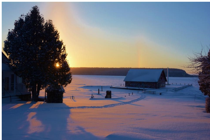
"SUN DOG"

Ephraim Moravian Church - PO Box 73, 9970 Moravia Street - Ephraim, WI 54211 920-854-2804