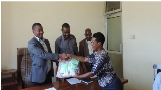
New hygiene kits for girls arriving in Tanzania via Bookfriends shipment