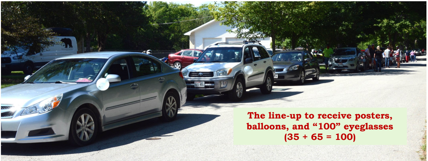
The line-up to receive posters, balloons, and “100” eyeglasses (35 + 65 = 100)