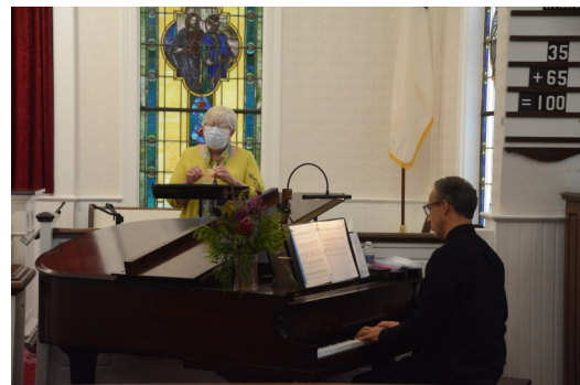
"Oh What a Beautiful Morning!"