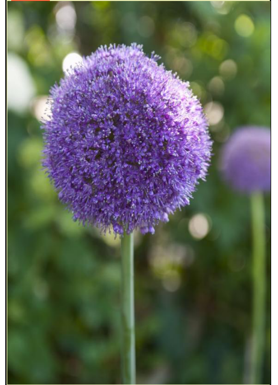
YOUR BOARD MEMBERS

Cell Number: 920-421-4042 (Church phone does NOT ring in the parsonage—<u>please keep the Pastor's cell phone number handy for after hours.</u>