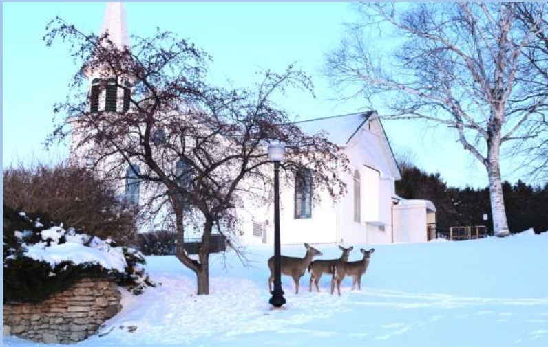
Deer attending Church in January

Postal Worker - thank you for delivering this to: