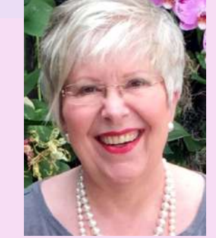
Sunday, April 24 - 10:30 a.m. in person and on Facebook