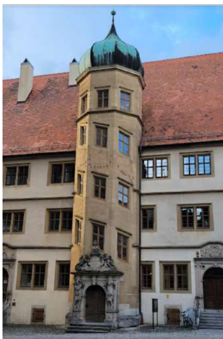
Medieval building in Rothensberg