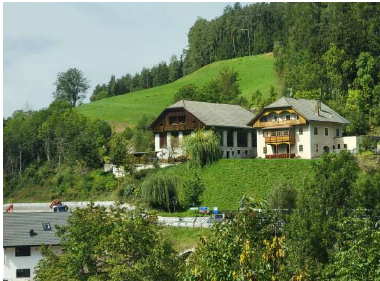
The Italian Alps