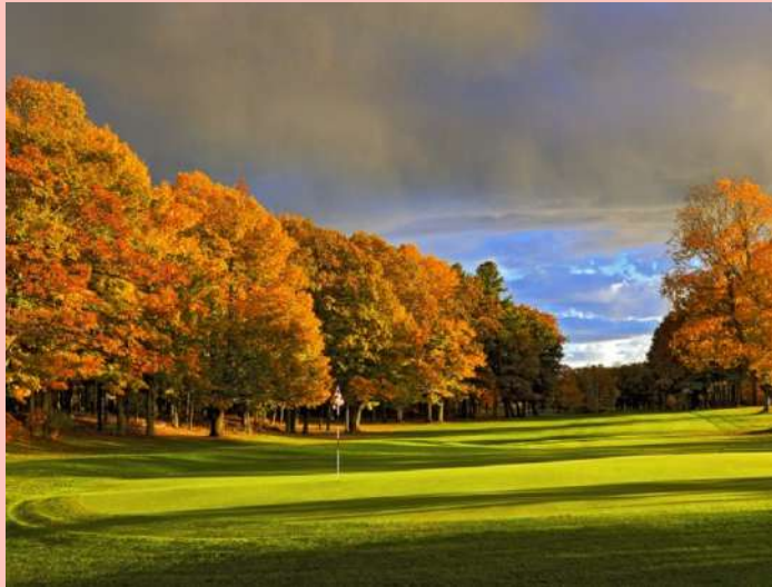
Peninsula Park Golf Course on a fall day

Ephraim Moravian Church worship@ephraimmoravian.org Website: www.ephraimmoravian.org 920-854-2804