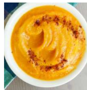
Roasted Acorn Squash Soup, one of the many vegan treats served up at Tricklebee!

This month marks the 6th anniversary of our community cafe! The team of neighbors who help Tricklebee Cafe to thrive continues to grow and expand. The joy, beauty, and abundance are tangible each day. I so love this work I get to participate in: rescuing almost-discarded food, then preparing and serving delicious meals with it which nourishes the bellies and hearts of all who pass through. It has been humbling to keep doing this good work during a global pandemic. There were indeed some terrifying moments financially and emotionally, but Tricklebee is still here, and going strong. We rely heavily on the generosity of friends who donate fresh produce, spices, canned beans, cleaning supplies, their volunteer hours, and finances to make our mission possible. I would like to thank each and every one of you for believing in this little community cafe. Thank you for encouraging us with your prayerful thoughts, your love notes, and your presence. Keep on with your good support!