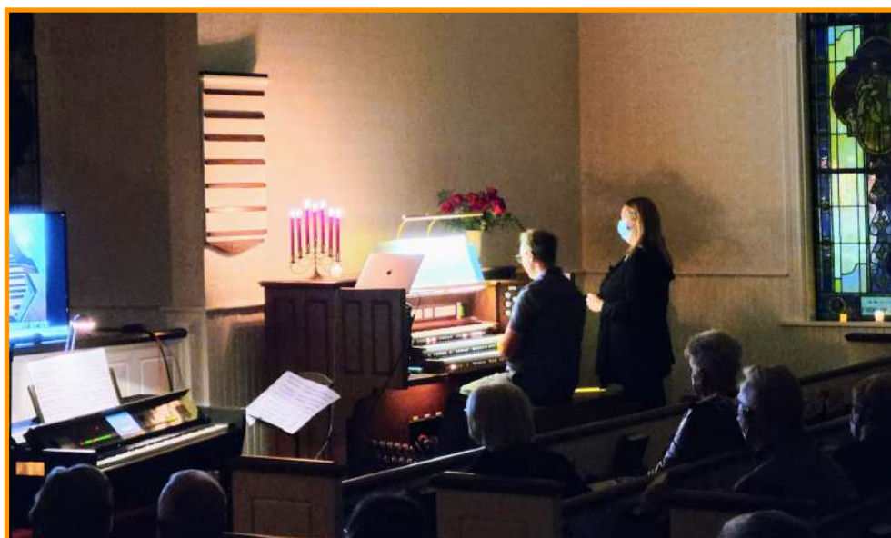
Lights Out for the spooky "Danse Macabre" Camille Saint-Saëns