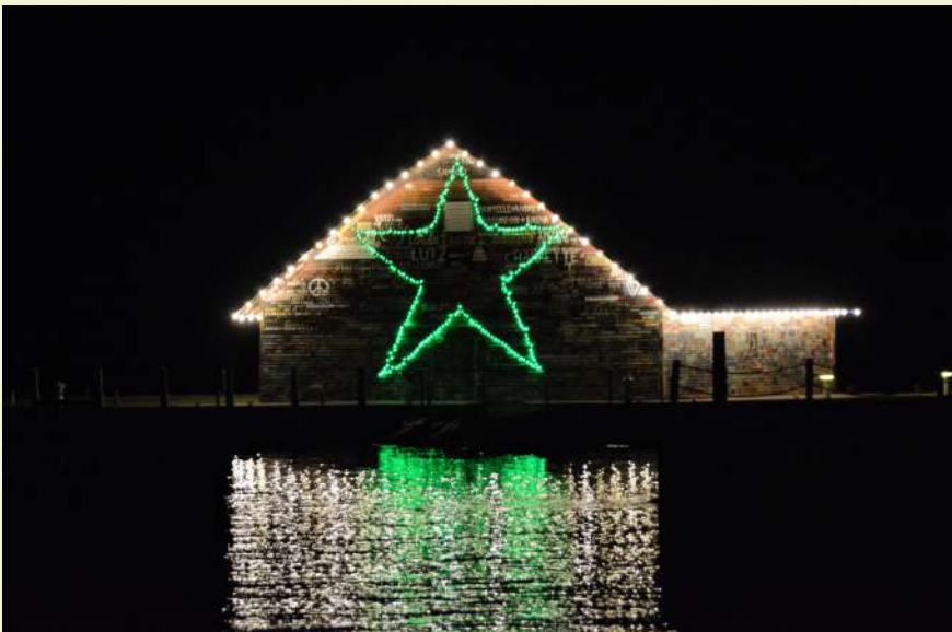
Christmas star on Anderson Dock

Postal Worker - thank you for delivering this to: