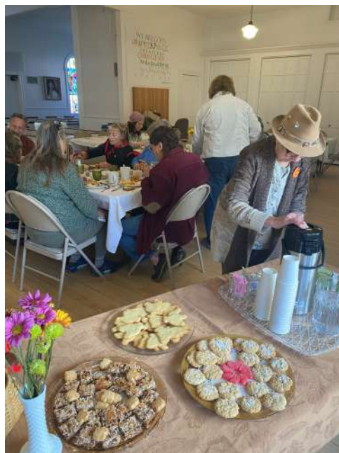
Photos from the Harvest Lunch.